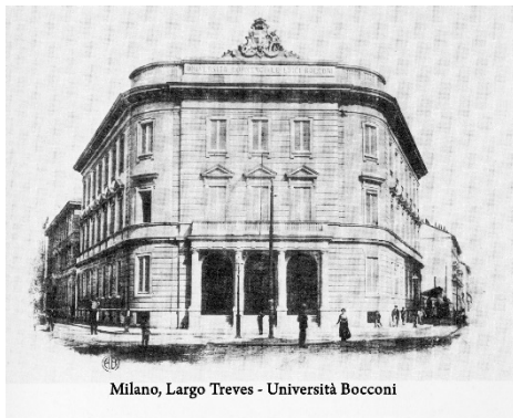
Milano, Largo Treves - Università Bocconi